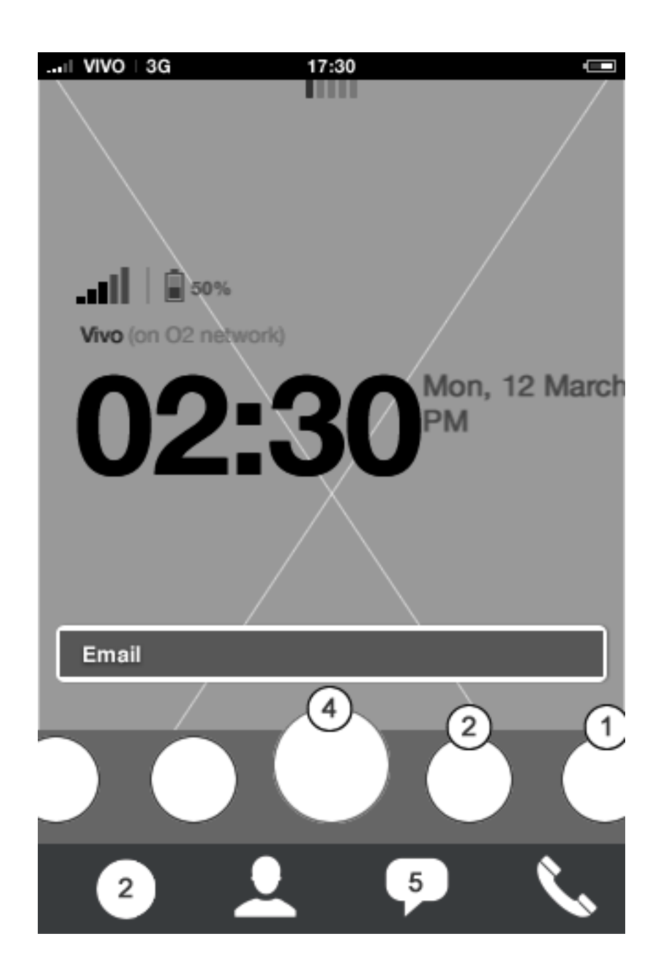
Homescreen: Preview closed Badge notifications in key app dock behaves according to app.