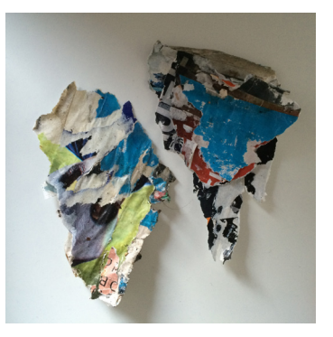
STREET POSTER SCRAPS

Have a look below on the various objects that have something to tell us.