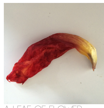
A LEAF OF FLOWER